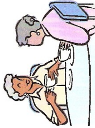
'A problem shared is a problem halved'